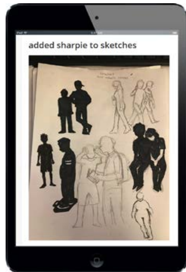
Above: Student blog posts documenting ideation phase of project; Below: Finished student silhouette project and accompanying artist statement