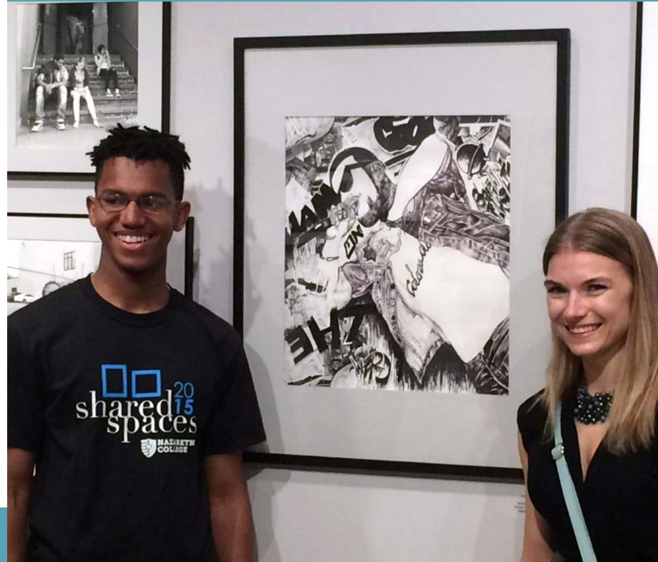
Above: Finished student typographic portrait with accompanying artist statement;