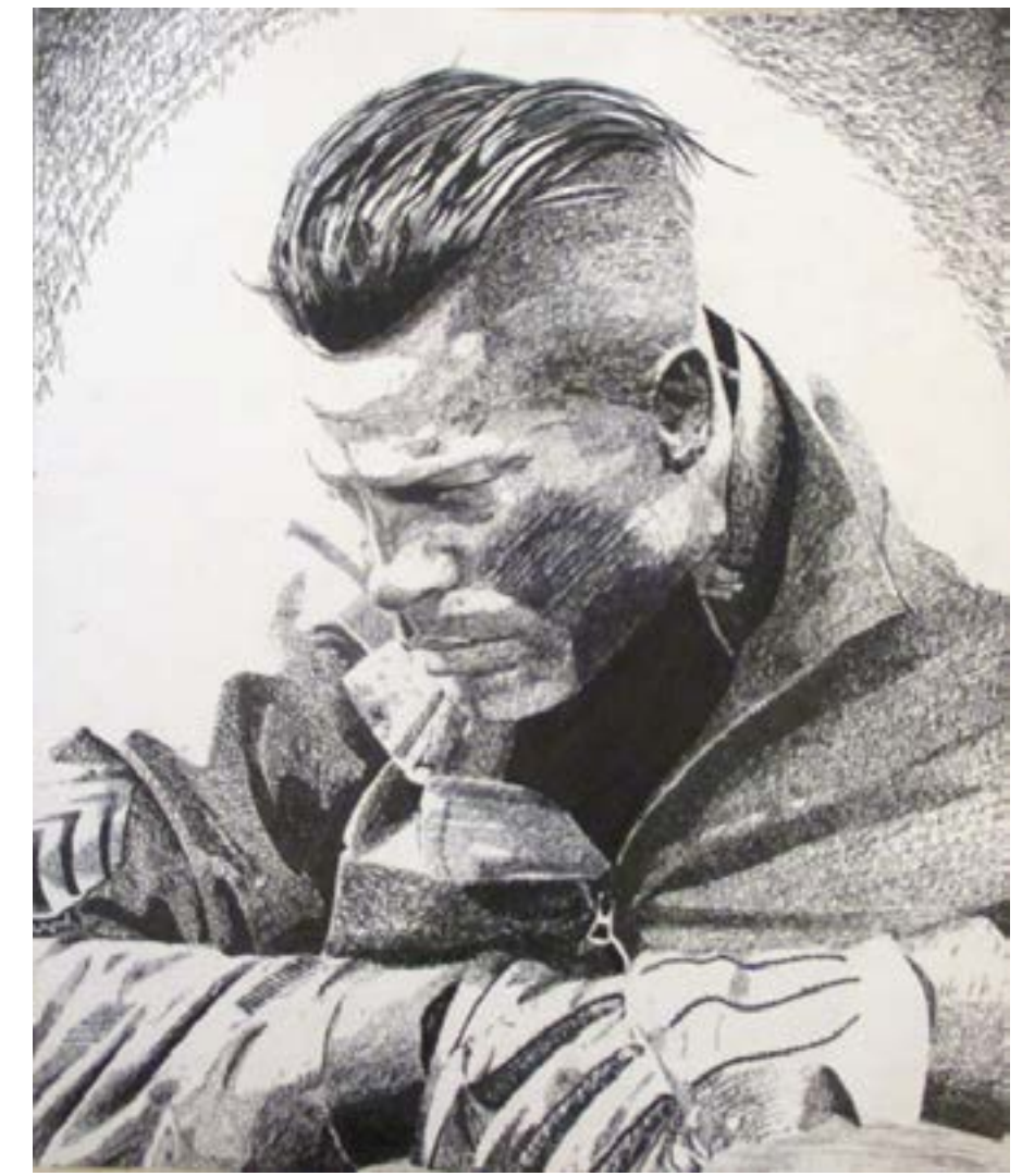
Above: Finished 12th grade typographic portraits;